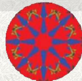
Exotique Gems Computer Generated Light Performance Map (ASEI) for this Diamond U.K. Patent No. 7,355,683 ■ Brightness ■ Less Bright ■ Contrast ■ Least Bright