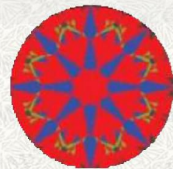
Exotique Gems Computer Generated Light Performance Map (ASET) for this Diamond. U.K. Patent No. 7,355,463 ■ Brightness ■ Less Bright ■ Contrast ■ Least Bright